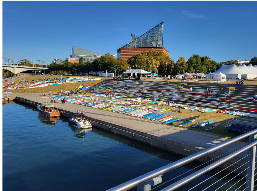
Chattajack 31 staging area day prior to the race.